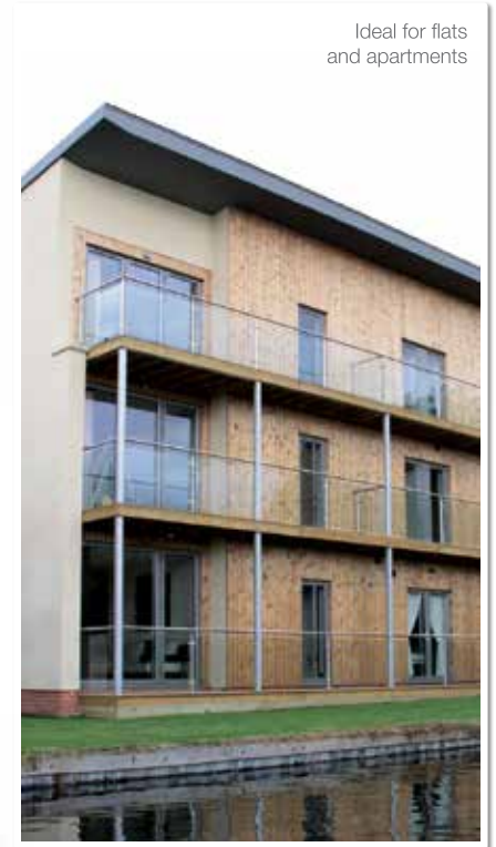
Ideal for flats and apartments