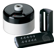
TELENORDIK 5T Code 22387