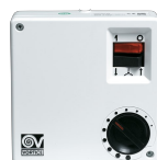
SCNR5 UNIF.X NK SOFFITTO Code 12955