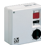
SCNRL5 UNIF. X NK SOFFITTO Code 12957