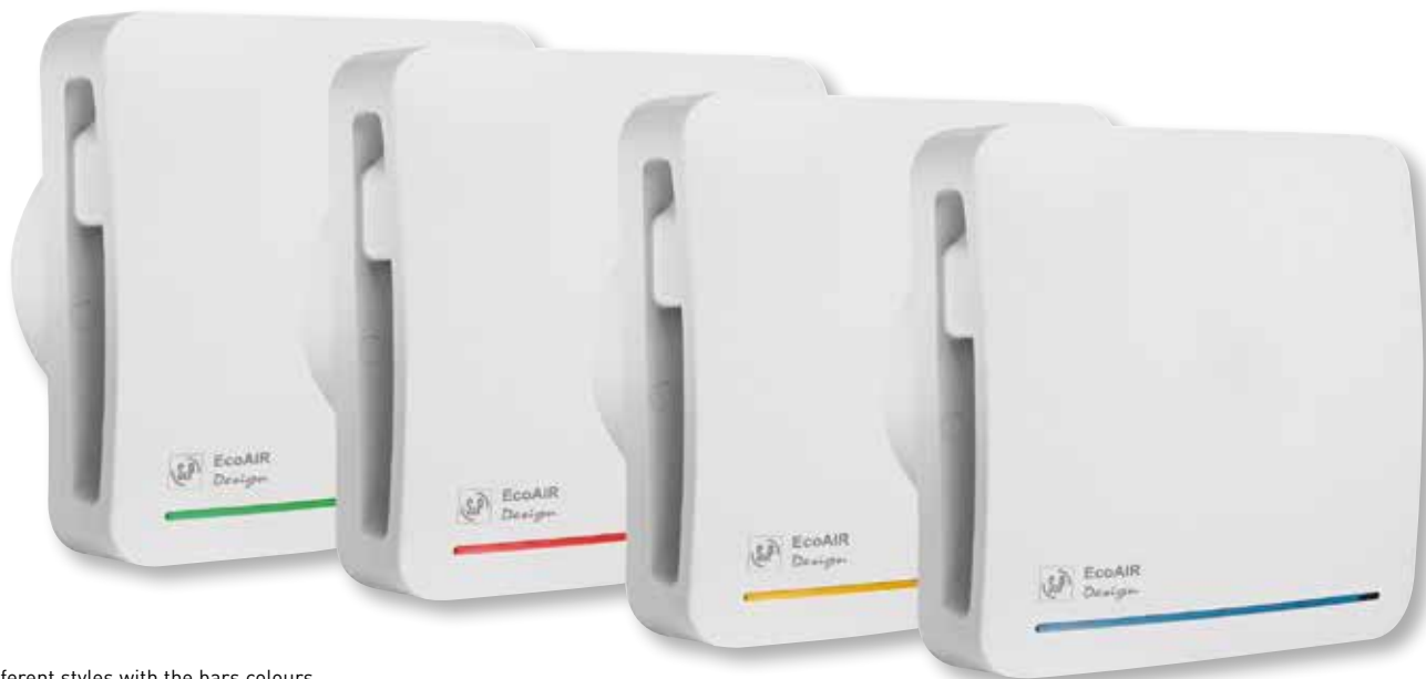
Different styles with the bars colours.