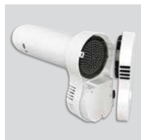
Maintenance and cleaning Easy access.