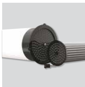
Tubular heat exchanger 100 or 150 mm.