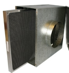
Duct Mounted Filter Housing (1825)