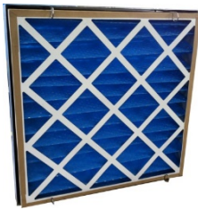
Front Withdrawal Frame (1810)

See Catalogue Section 8 (code AC8) for full information.