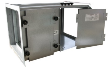
Fully Welded Side Withdrawal Filter Housing (1840)