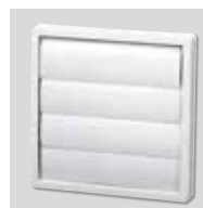
PER-100W Back draft shutter.